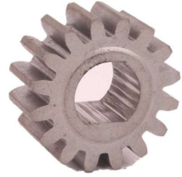
GEAR FOR HANDLE