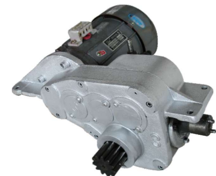
MOTOR WITH GEAR