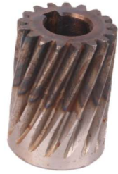
GEAR FOR MOTOR