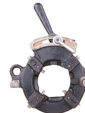
DIE HEAD ASSEMBLY REX