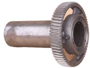
GEAR WITH PIPE