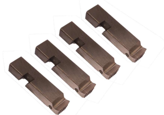
DIE - BSPT OR NPT