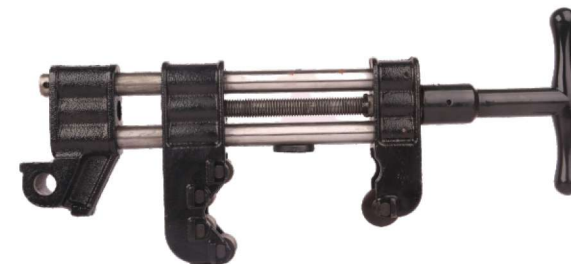
CUTTER ASSEMBLY HEAVY DUTY