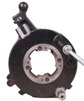
DIE HEAD ASSEMBLY