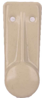
SURPPORTING LEG FOR GUIDE POST