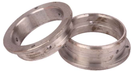
FRONT AND REAR BUSHING