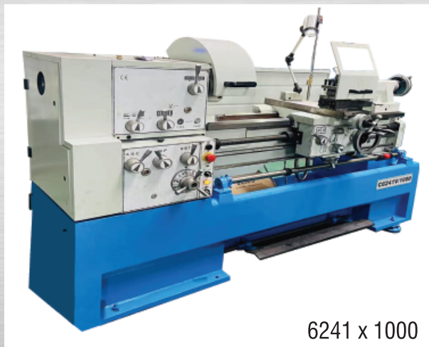
6241 x 1000