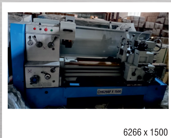
6266 x 1500

Fully Loaded Lathe Machines Centre height 200 mm to 1000 mm with 1000 ABC to 16000 mm ABC