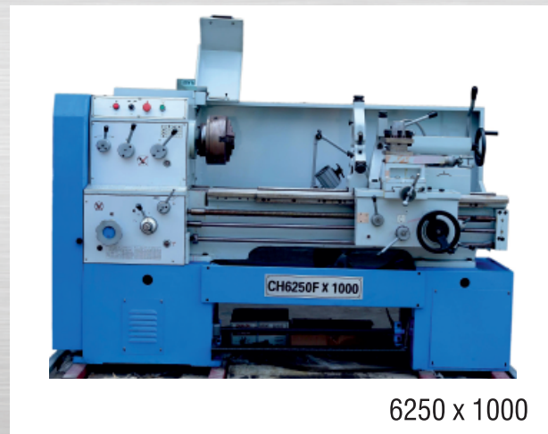
6250 x 1000